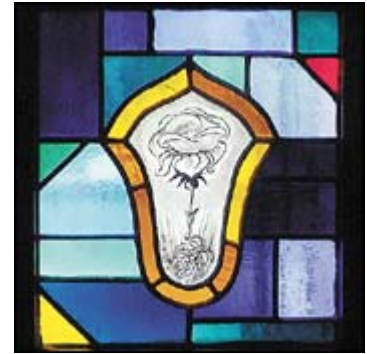
This stained glass window was dedicated to the memory of Tommy Roper 40 years ago.