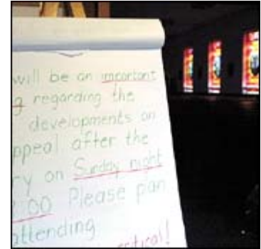
This sign hangs at the entrance to St. Jeremiah's Church in Framingham.